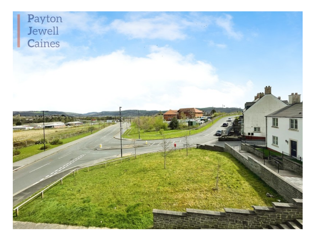
For more photos please see www.pjchomes.co.uk