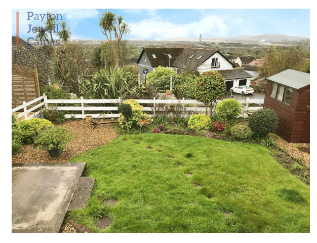
For more photos please see www.pjchomes.co.uk