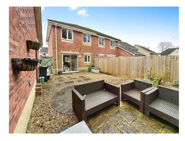
For more photos please see www.pjchomes.co.uk