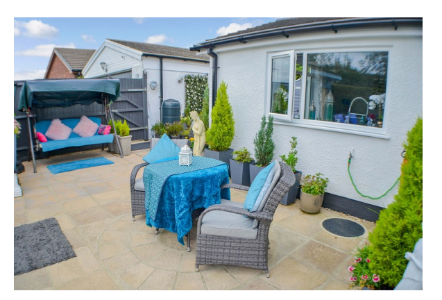
For more photos please see www.pjchomes.co.uk