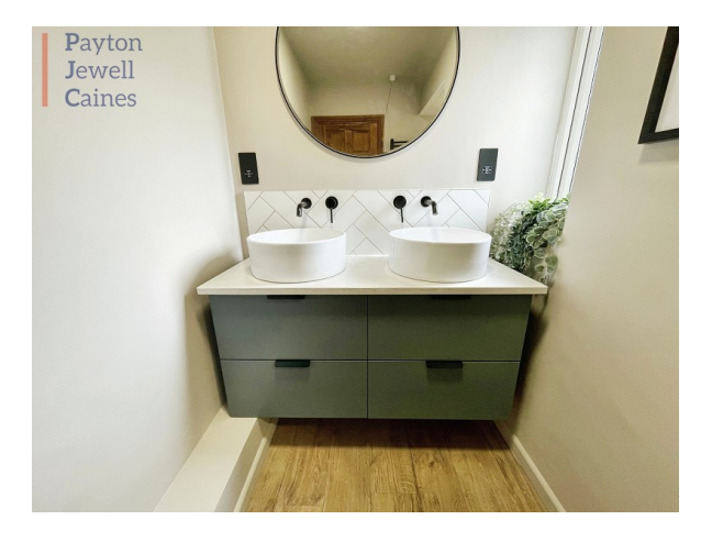
For more photos please see www.pjchomes.co.uk