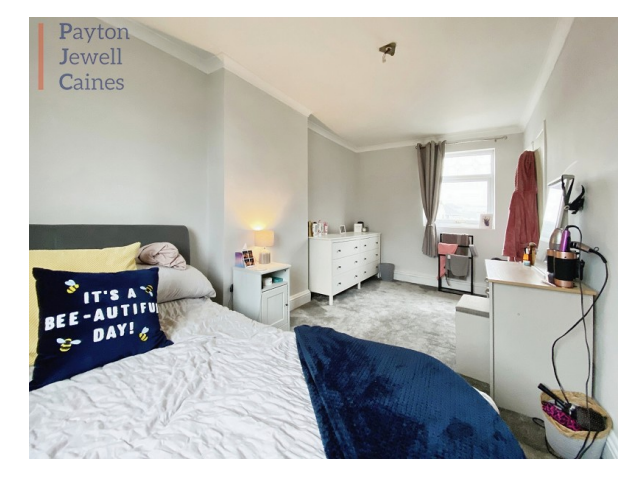
For more photos please see www.pjchomes.co.uk