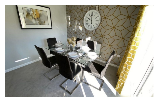
For more photos please see www.pjchomes.co.uk